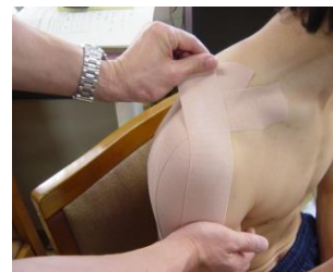
elasticized sports taping