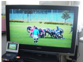
game analysis of Rugby