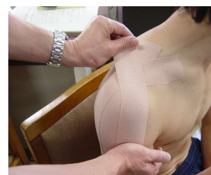
elasticized sports taping