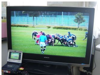
game analysis of Rugby